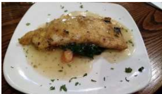
Corn Crusted Fluke