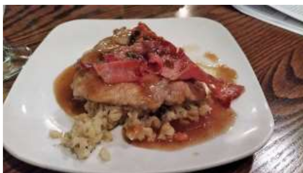
Pheasant with Mushrooms and Prosciutto