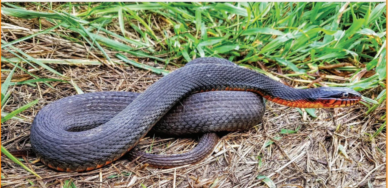
#29 Restoring Wetland Habitat for the Federally Threatened Copperbelly Watersnake - Williams County, OH