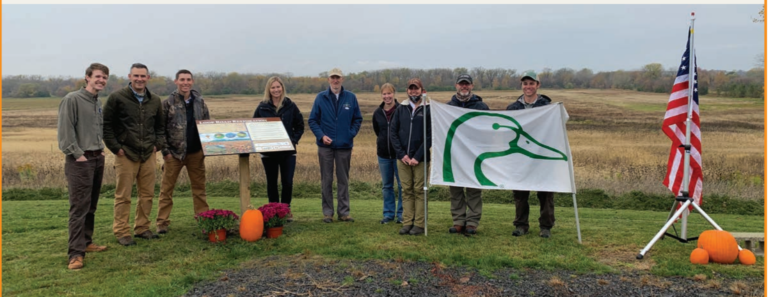
#70 Loop Road Wetland Restoration GLRI Project Dedication - Montezuma Wetlands Complex