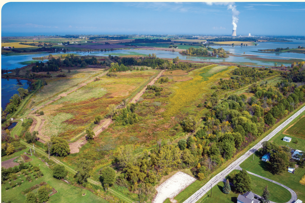
#59 Toussaint Wildlife Area Coastal Wetland Enhancement & Fish Passage Project