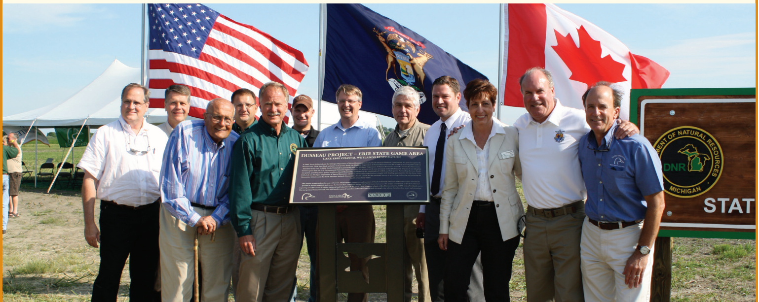
#4 Dusseau Wetland/Lakeplain Prairie Restoration - GLRI Project Dedication

Funding Source: GLFWRA Funding Amount: $313,500 Habitat Restored: Protected 166 acres of wetlands or wetland buffers Partners: Black Swamp Conservancy, Ohio DNR DOW, Michigan DNR, USFWS, Ottawa NWR and Detroit River IWR Congressional District: MI-7; OH-9; OH-5