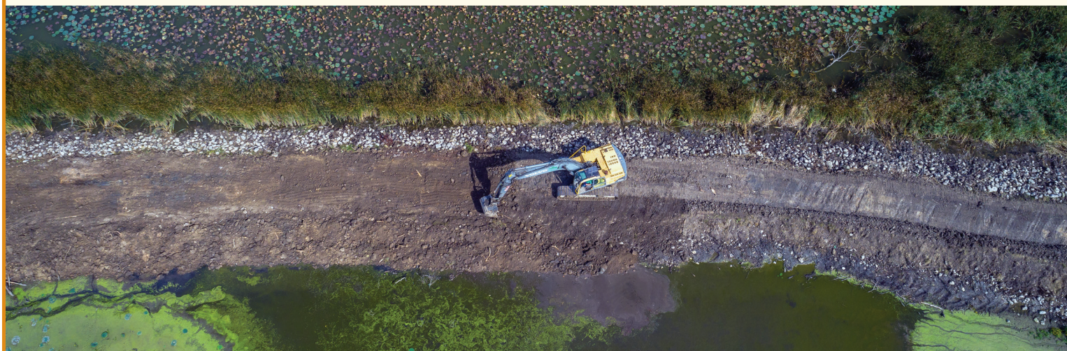
#59 Construction at Toussaint Wildlife Area Coastal Wetland Enhancement & Fish Passage Project