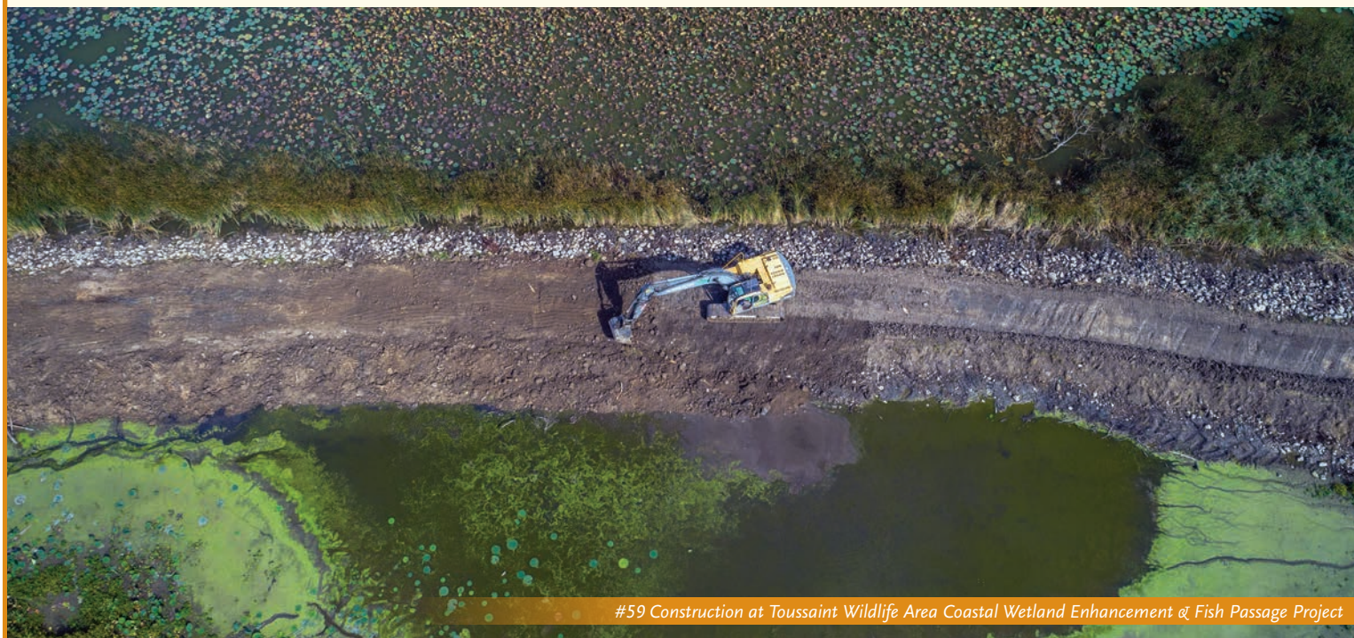
#59 Construction at Toussaint Wildlife Area Coastal Wetland Enhancement & Fish Passage Project