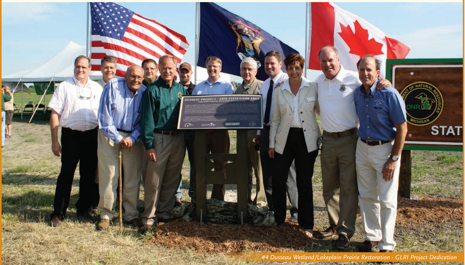
#4 Dusseau Wetland/Lakeplain Prairie Restoration - GLRI Project Dedication