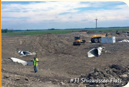
#31 Shiawassee Flats