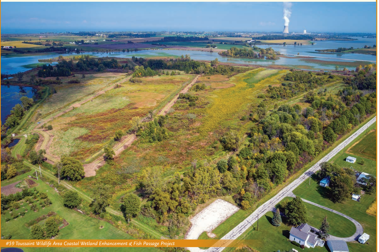
#59 Toussaint Wildlife Area Coastal Wetland Enhancement & Fish Passage Project

TNC Funding Amount: $2,207,257 Habitat Restored: 220 acres of coastal wetlands Partners: TNC ( grantee ), Erie Shooting & Fishing Club, USFWS Congressional District: MI-7