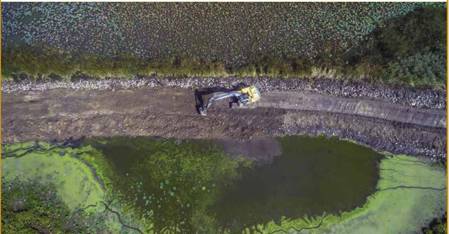
#59 Construction at Toussaint Wildlife Area Coastal Wetland Enhancement & Fish Passage Project