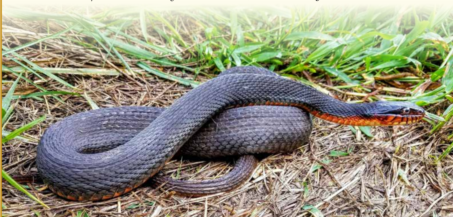
#29 Restoring Wetland Habitat for the Federally Threatened Copperbelly Watersnake - Williams County, OH