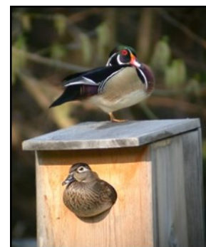
The Royal Couple

here in short order and pairs will be looking for a place to nest. Right now is the last opportunity to construct and install a nest box if you're interested and if you've already got one, its time to head out and do a little spring cleaning before the lake ice is gone. Improperly installed or unmaintained wood duck boxes can do more harm than good so its essential that you get out there now in advance of their arrival. Click here to learn more about wood duck conservation, biology, nest box plans, and nest box placement. Good luck, enjoy, be safe, and thanks for all you do for waterfowl!