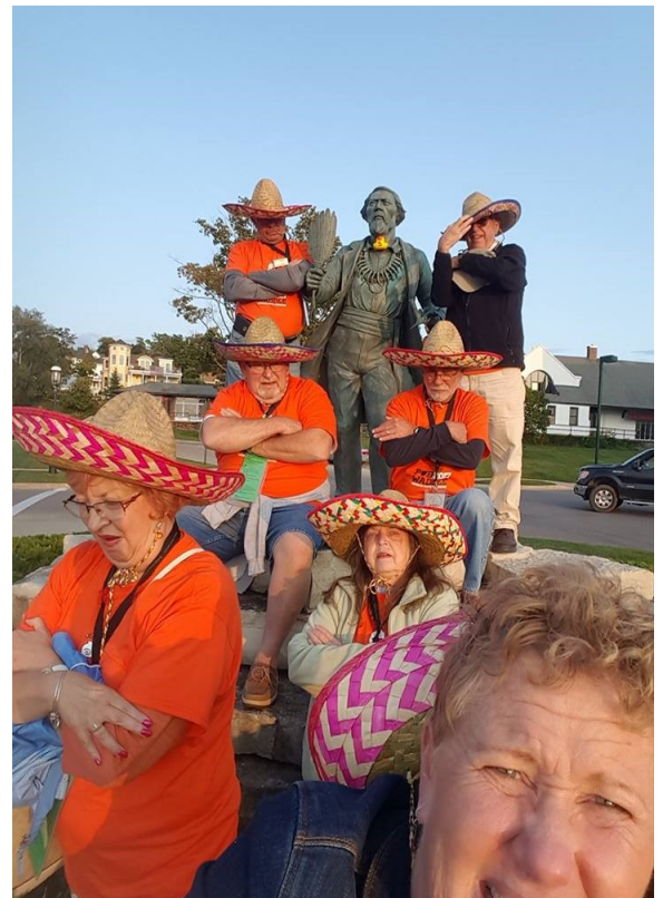
State Convention parting shot, fun on the pub crawl in Petoskey—not sure about these amigos!!!!

https://www.facebook.com/ MichiganDucksUnlimited/