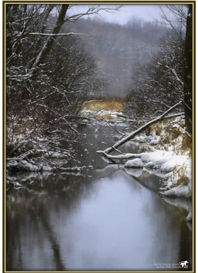
A Painted Wetland Marsh In A Snowy And Cold Winter