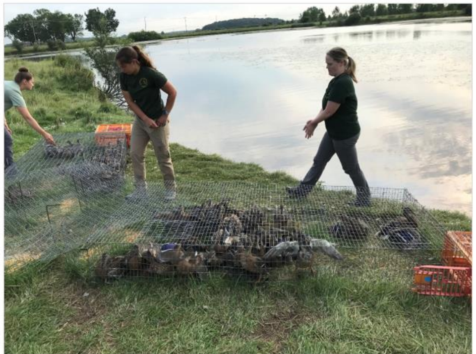
Figure 1. Michigan DNR staff crating bait trapped mallards for banding and radio marking.

The distribution of mallards during migration and winter is shifting northward, and it could be that mallards are shifting their breeding distribution as well. Anecdotally, biologists are now seeing more mallards in urban environments, but these birds are not counted as part of annual breeding waterfowl surveys due to safety restrictions. Mallards are flexible and changes in behavior may be learned but they may also be linked to changes in genetics. Releases of game farm mallards may be impacting the genetic makeup and behavior of wild mallard populations in North America and the Great Lakes.