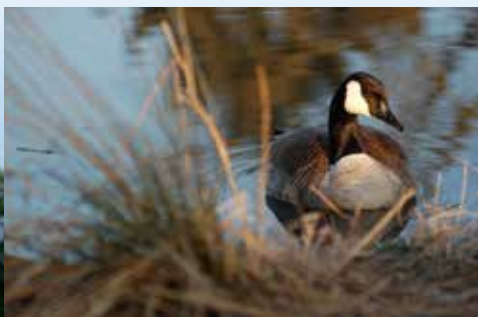
Left: Canada goose Middle: Blue-winged teal Right: Wood duck