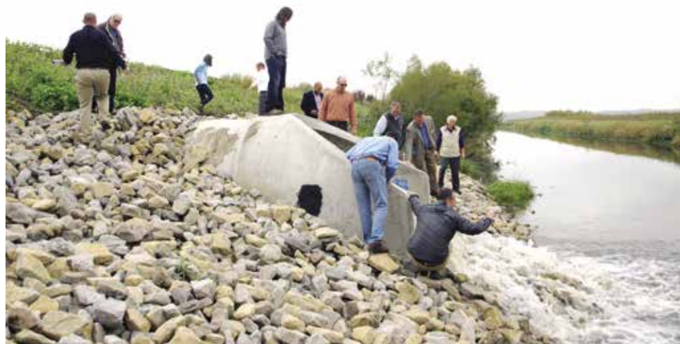
Conservation partners check out the DU project at Shiawassee National Wildlife Refuge.

The Maankiki Marsh project at Shiawassee was funded in part by a $1.5 million National Fish and Wildlife Foundation – Sustain Our Great Lakes grant via the Great Lakes Restoration Initiative, a federal program designed to target the most significant problems in the Great Lakes ecosystem. Saginaw Bay Watershed Initiative Network, Dow Chemical Company and Ducks Unlimited provided additional financial support.