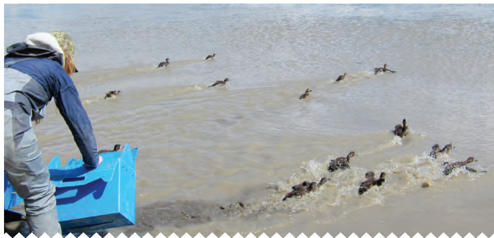
Volunteers release banded scaup on Red Rock Lakes National Wildlife Refuge