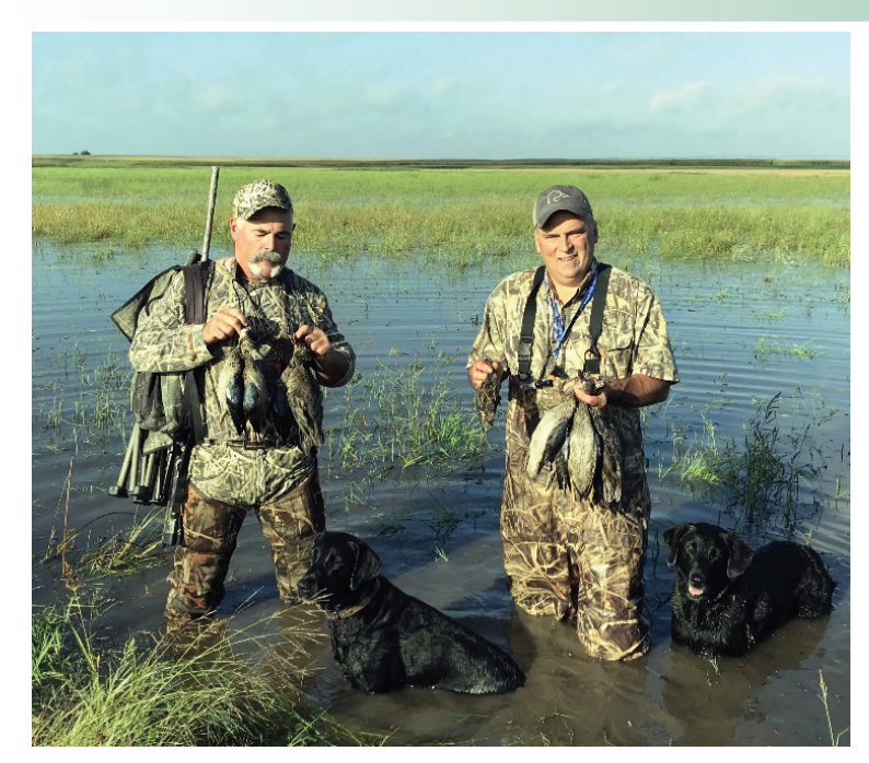
DU Working to Ensure Water Availability in the Rainwater Basin