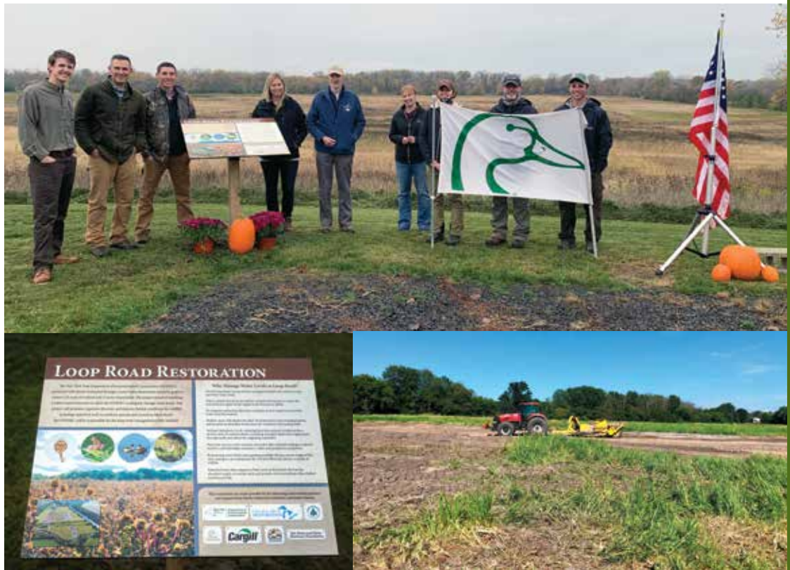
DU partners and supporters gathered in October to celebrate the restoration of the Loop Road project at Northern Montezuma Wildlife Management Area.

The site is a success story of cooperation between a wide range of partners, including Cargill, NYSDEC, the Great Lakes Restoration Initiative, the Helen and Ritter Shumway Foundation and the Friends of the Montezuma Wetlands Complex.