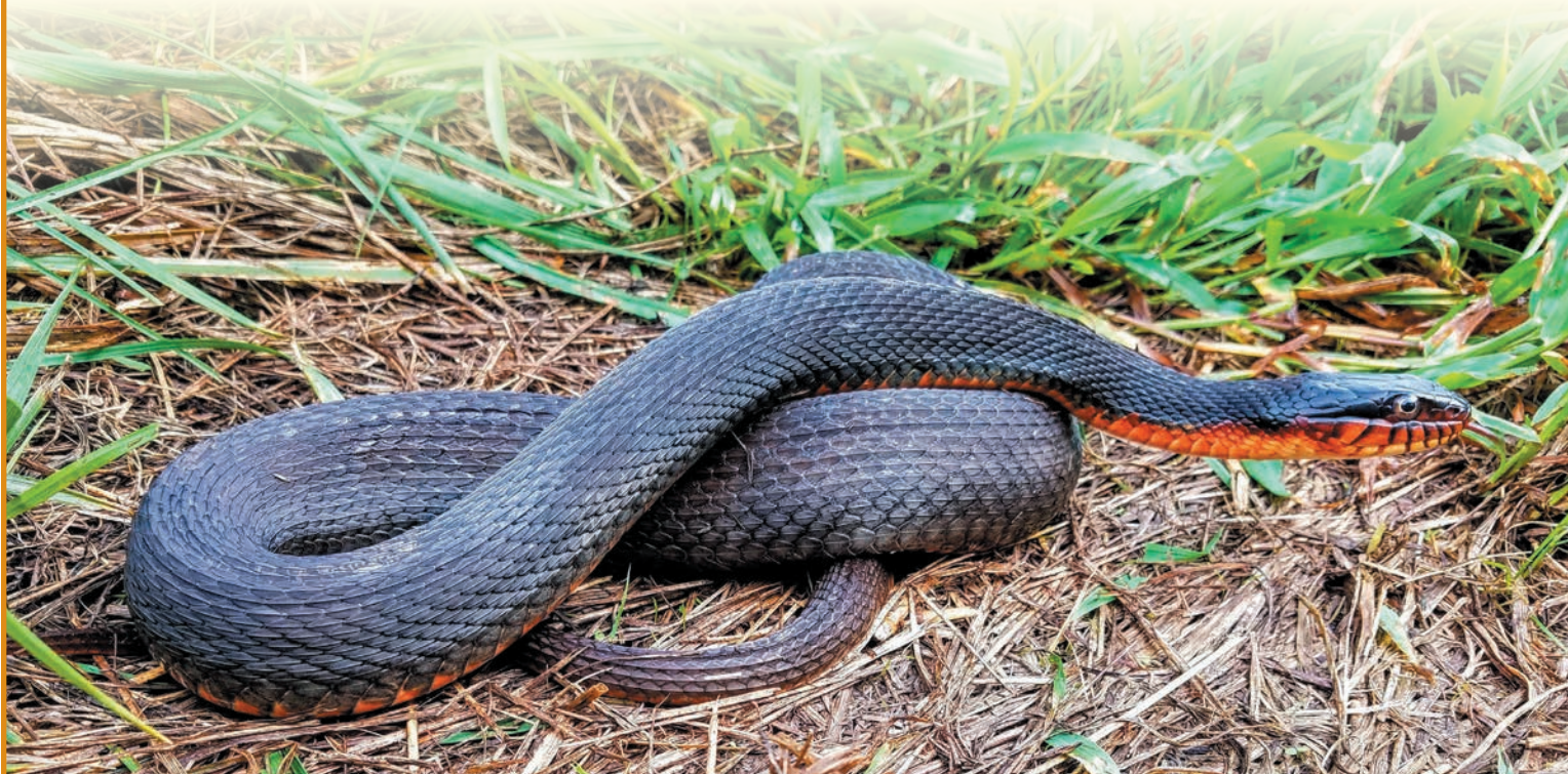
#29 Restoring Wetland Habitat for the Federally Threatened Copperbelly Watersnake - Williams County, OH