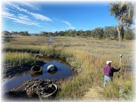
Surveying on Sapelo Island Wildlife Management Area

Georgia's Campaign Committee secured 4 new Major Sponsors, 2 new Life Sponsors and 2 new Diamond Sponsors. These sponsorships will benefit wetland conservation across the Peach State.