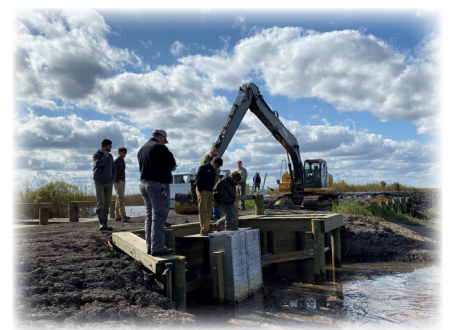
Field day with GA Coastal Waterfowl Shareholder Group and GADNR at Rehfts Island.