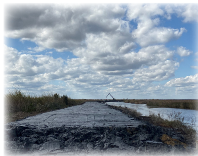
Rhett's Island Phase 1